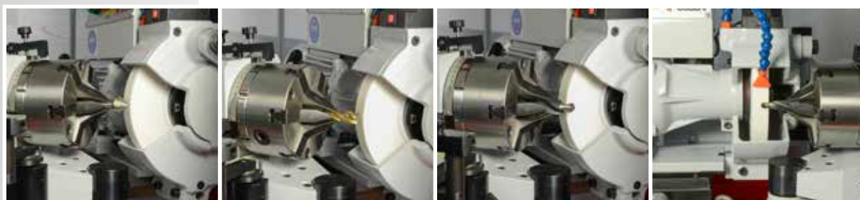
APE 40 UP - APE 40 AUTOMATIC - APE 60 EXAMPLES OF SHARPENING