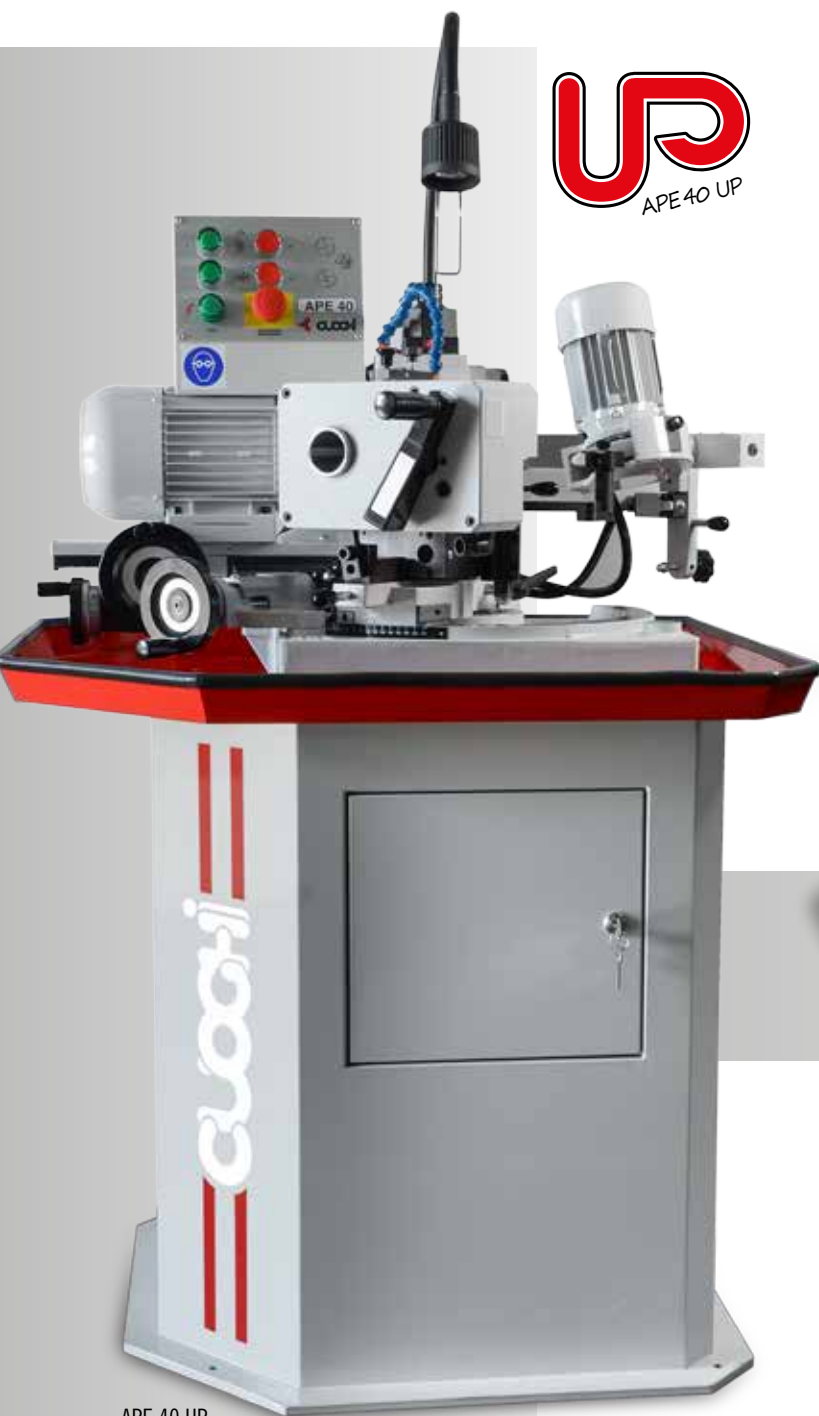
APE 40 UP